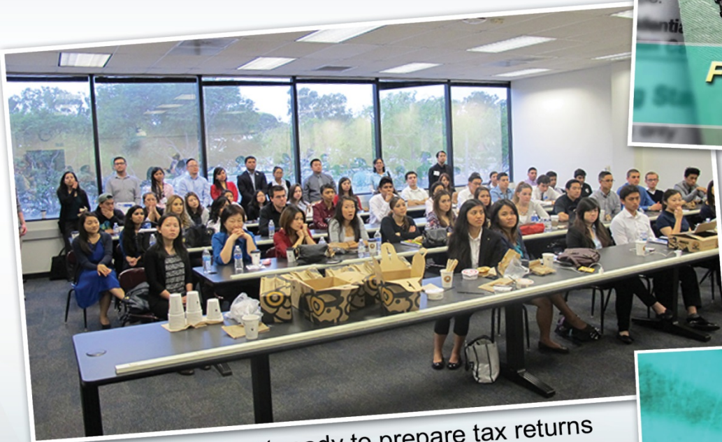
volunteers get ready to prepare tax returns